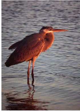
"Heron at Sunset # 2"