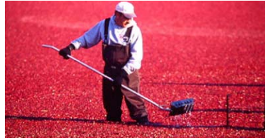
"Cranberry Harvester II"