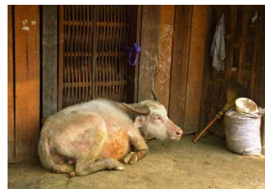
"Albino Water Buffalo - Vietnam"