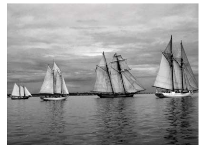
"Sails in Line"