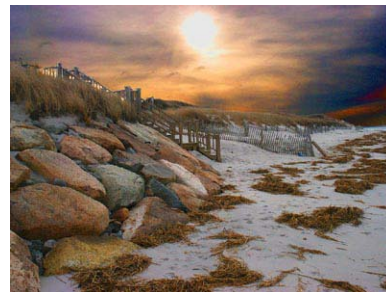
"Mayflower Beach" by Jim Mills